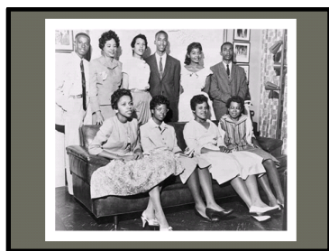
The Little Rock Nine Students & Daisy Bates

This program was developed as part of a grant by the Chicago Tribune Freedom Museum. It incorporates a power point presentation of photos from the University of Arkansas archives ( used with permission ).